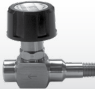
533 3043 Shown

The unique design of the 533 Series allows low torque operation with gas flow in either direction. Directional arrows are provided to indicate suggested flow direction.